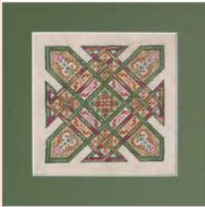
Celtic Quilts: Kentucky Chain by Ink Circles