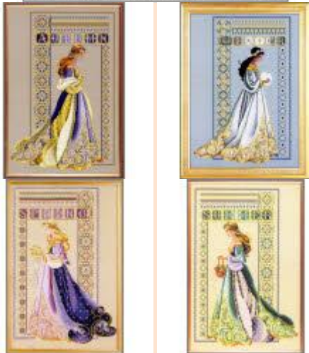
Celtic Autumn, Winter, Spring, Summer – aka Celtic Ladies by Lavender & Lace