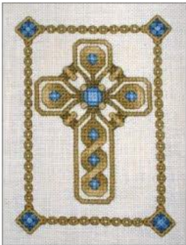
Celtic Jeweled Cross by Dracolair Creations