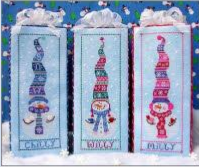
Snowman Trio by Stitchy Kitty