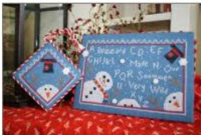
Wild Snowmen by Cherrywood Design Studios