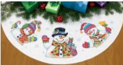
Snowman Tree Skirt by Dimensions