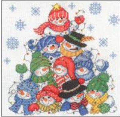
Stacking Snowmen by Imaginating