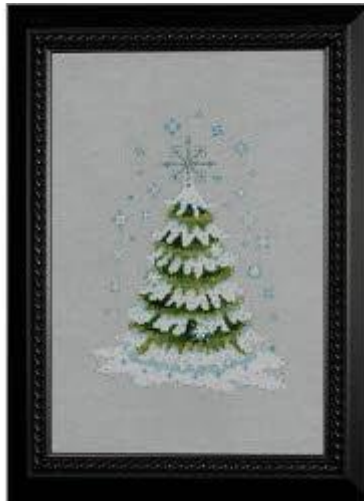
Christmas Tree by Nora Corbett