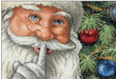
Santa's Secret by Dimensions