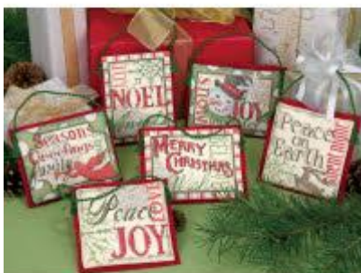
Christmas Sayings by Dimensions