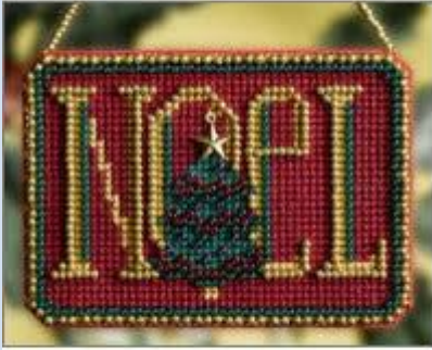
Noel by Mill Hill