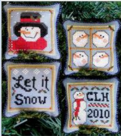
Snowman Ornaments by Prairie Grove Peddler