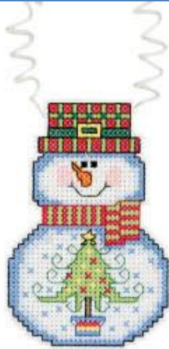
Holiday Wizzers Ornament Snowman with Tree by Janlynn