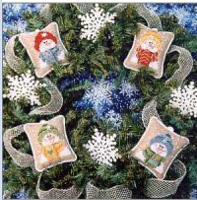
Let It Snow Ornaments by A Stitcher's Hands