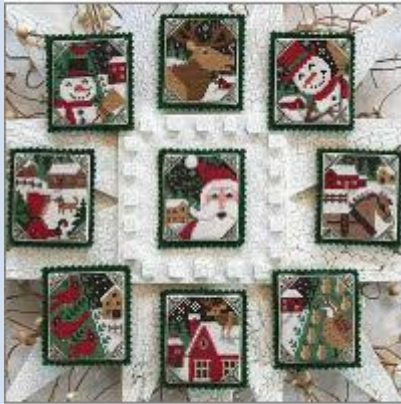
Snowy Nights by The Prairie Schooler