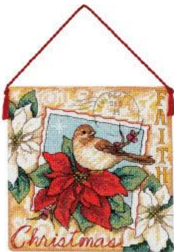
Faith Ornament by Dimensions Inc.