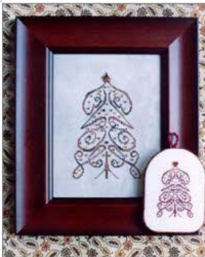
Love Tree by M-Designs