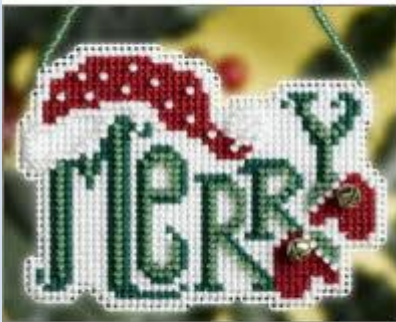
Merry Ornament by Mill Hill