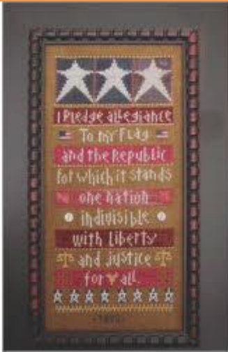
I Pledge Allegiance by Samsarah Design Studio