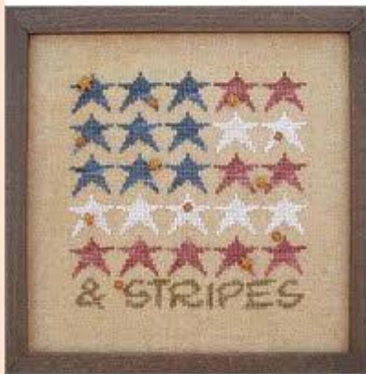
Stars and Stripes by Samsarah Design Studio