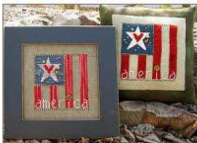
Doubles - America by Samsarah Design Studio