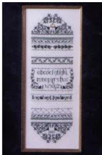
Shamrock Sampler by The Sweetheart Tree