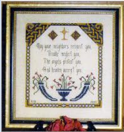
Irish Toast by The Sunflower Seed