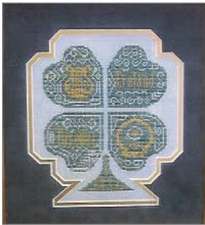
Celtic Shamrock by The Sunflower Seed