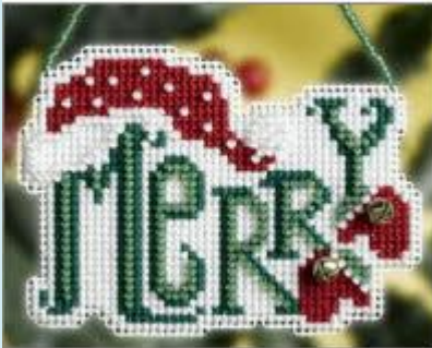
Merry Ornament by Mill Hill