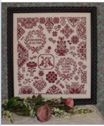
My Token of Love by Rosewood Manor