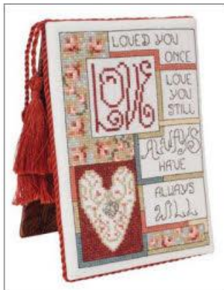
Love Stand Up by Stoney Creek