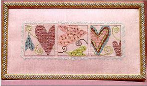
Three Hearts by A Needle & Fred